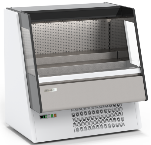
Available in Black or White finish